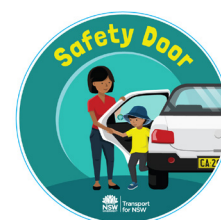
Kids and Traffic Safety Door sticker RTA45091021K

A driver pulls into the kerb and remains in control of the vehicle while an identified supervising adult from the school community assists students to exit or enter the vehicle.