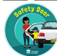
Kids and Traffic Safety Door sticker RTA45091021K